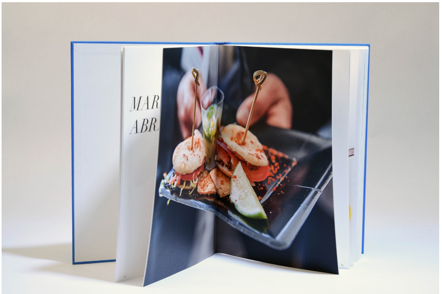
RECIPE/ILLUSTRATION, ABOVE: MARINA ABRAMOVIC / BELOW: PEDRO REYES