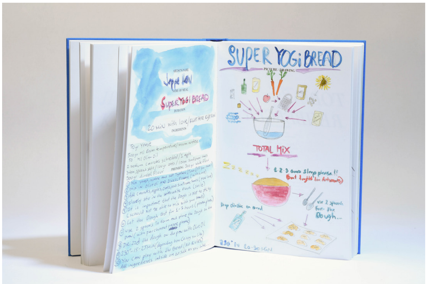
RECIPE/ILLUSTRATION, ABOVE: FABIAN MARTI / BELOW: JEPPE HEIN